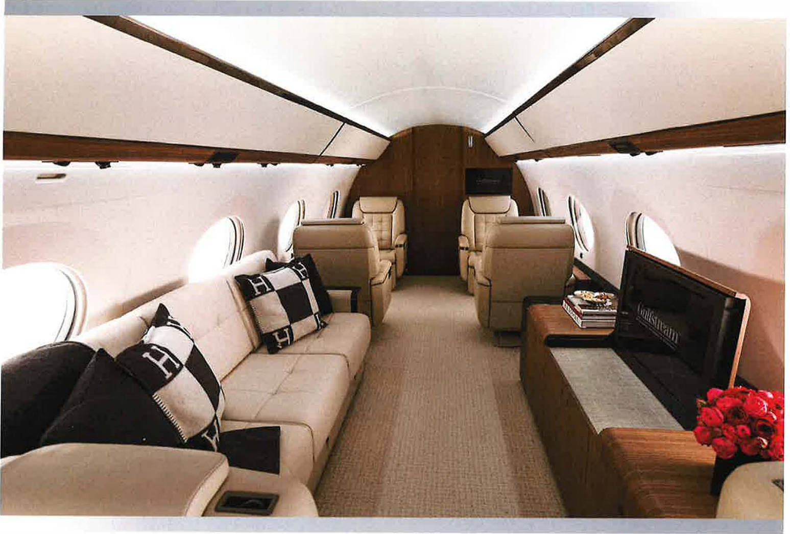
Mid cabin - forward