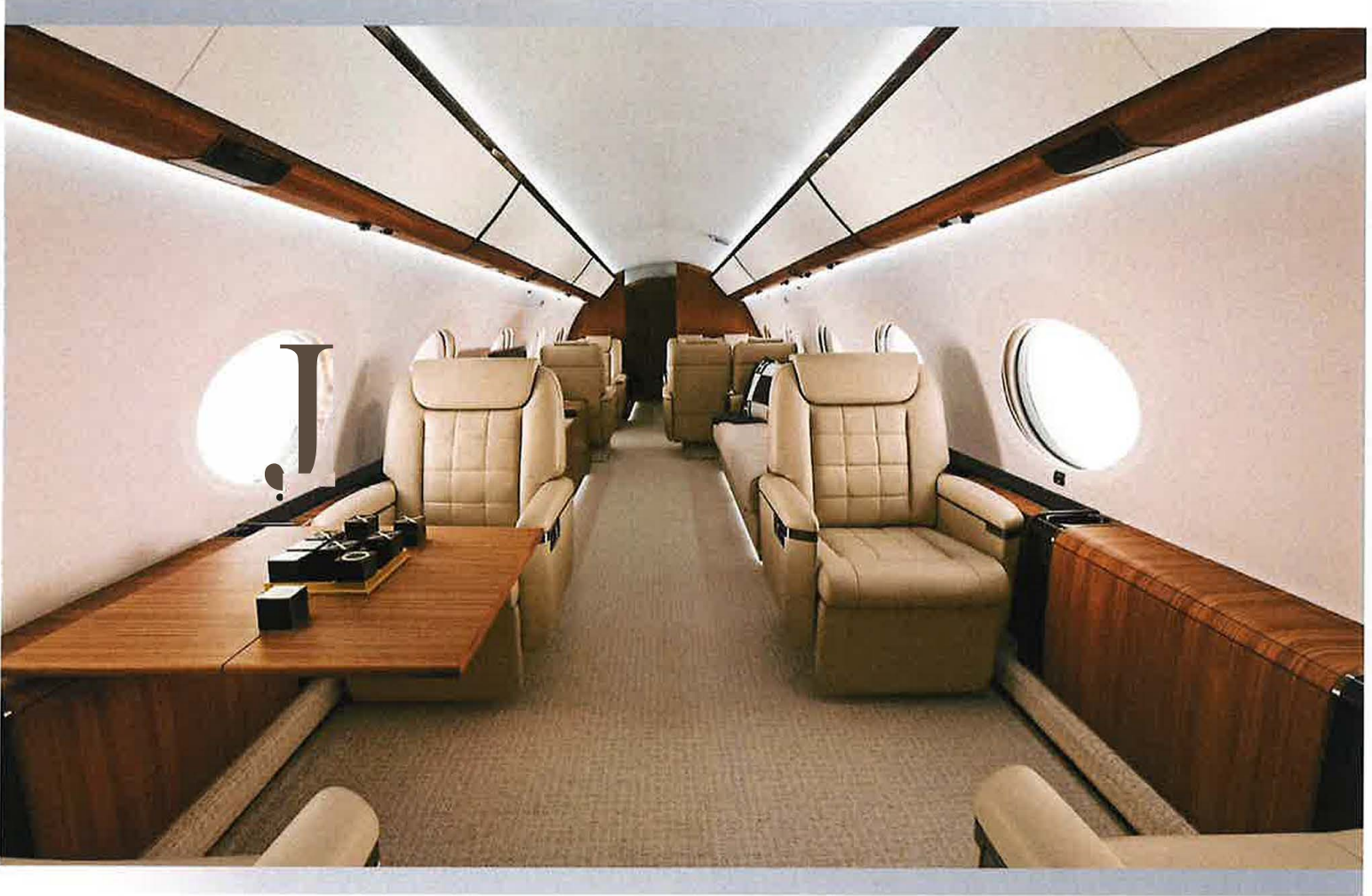
Forward cabin looking aft