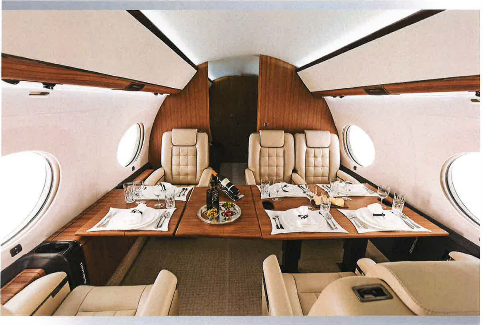
Mid cabin - aft