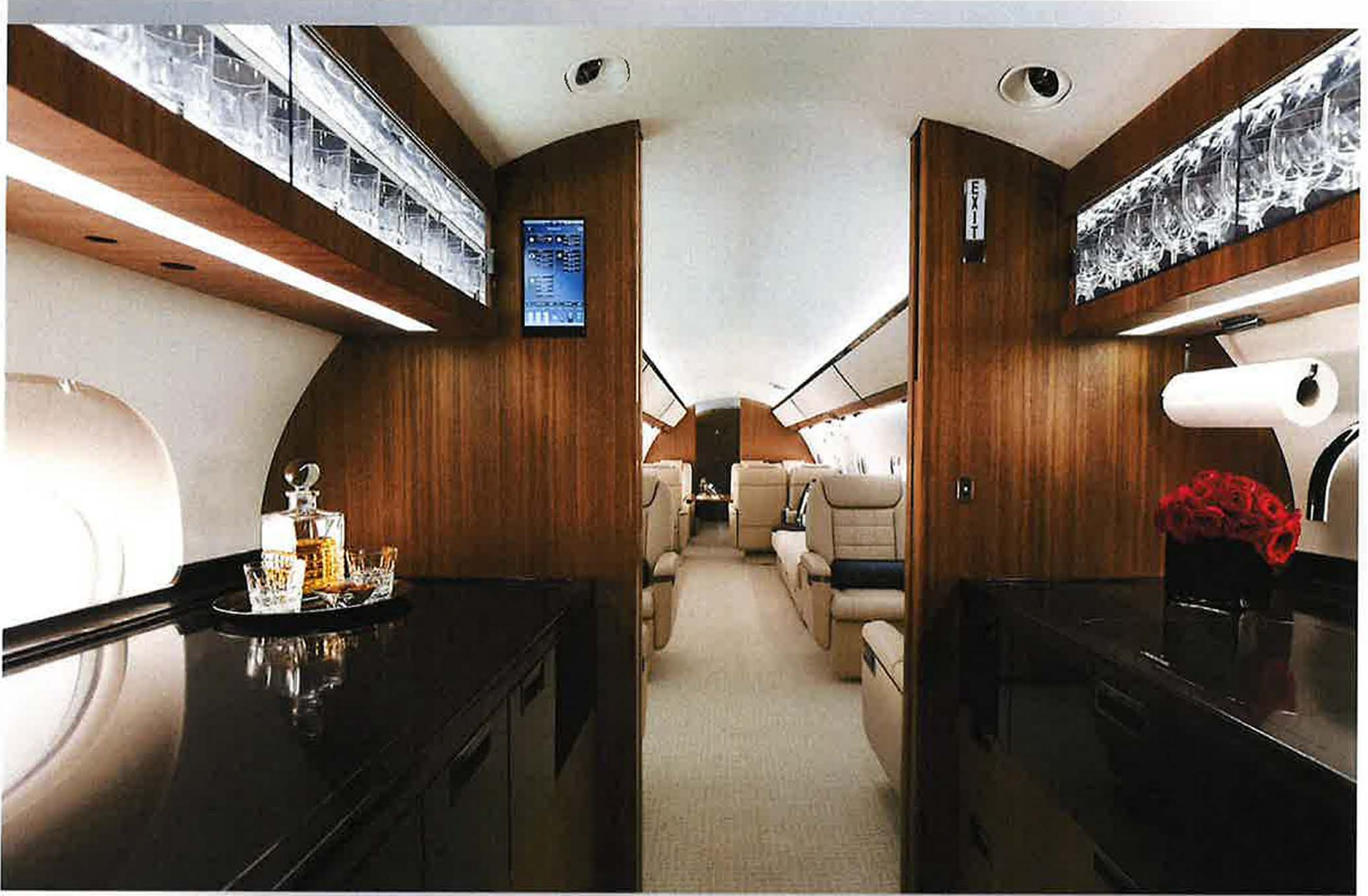
Forword/ gal/cw one/ galley annex