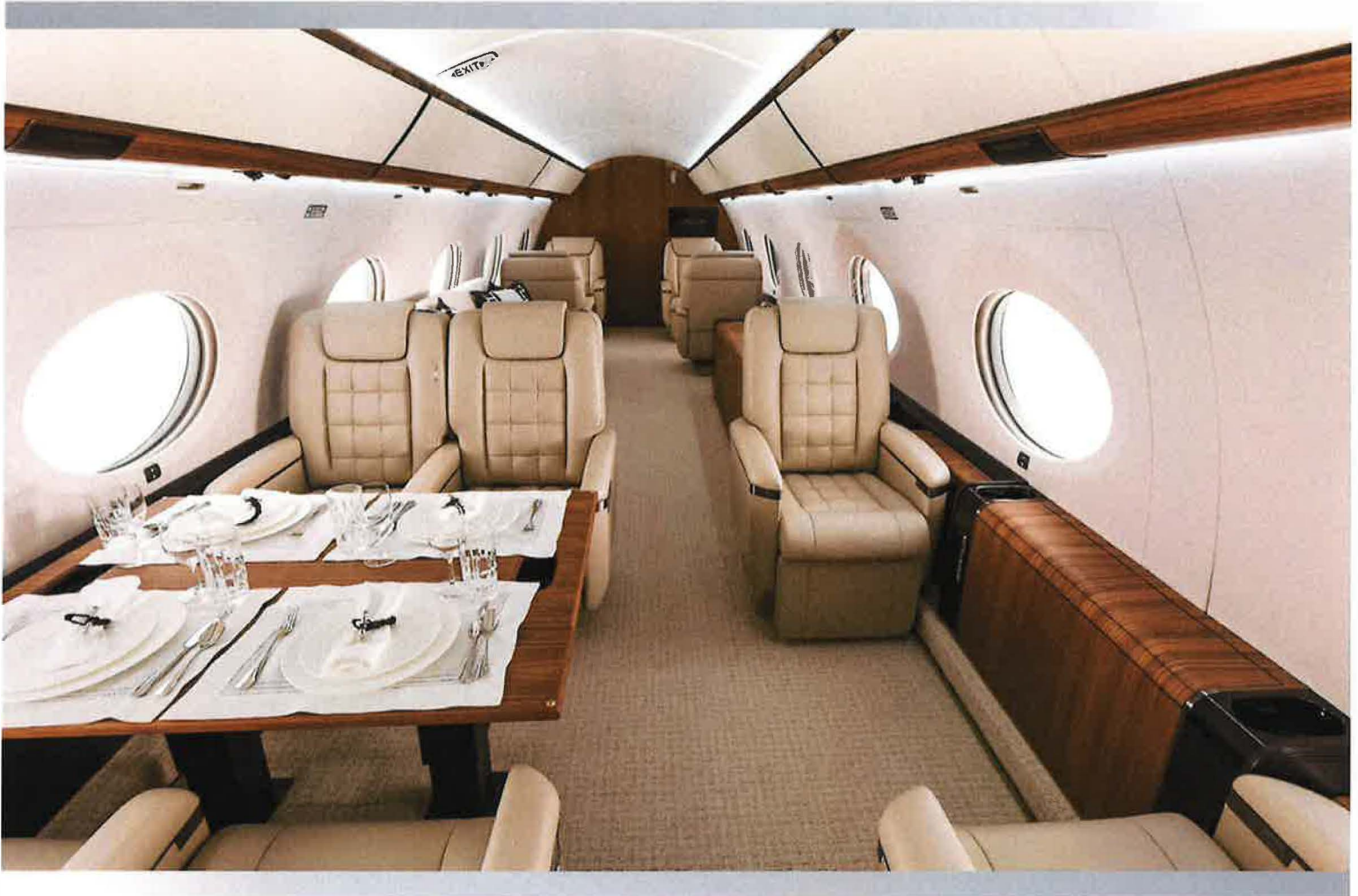
Mic/ cabin - aft, looking forward