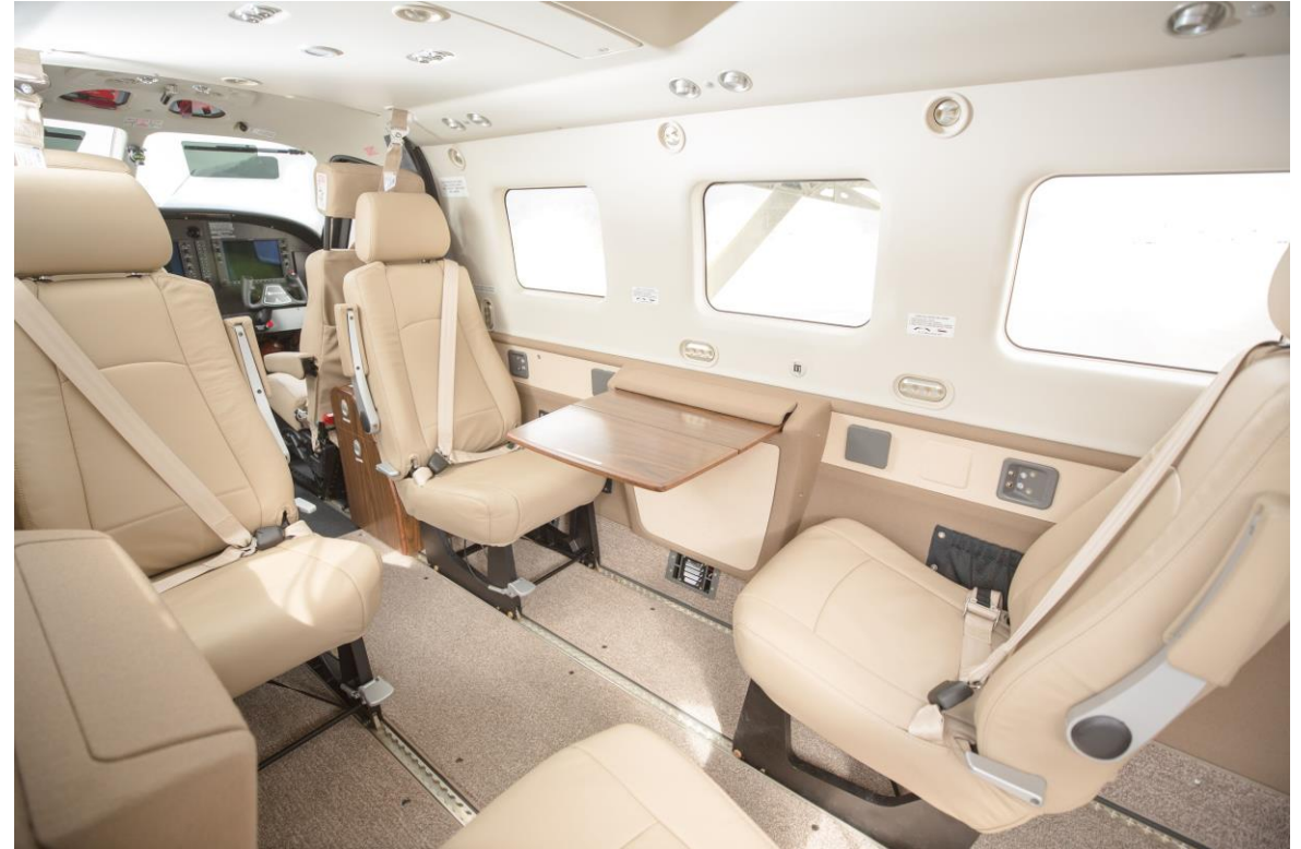
*Summit Interior (Not Actual Aircraft Pictured)