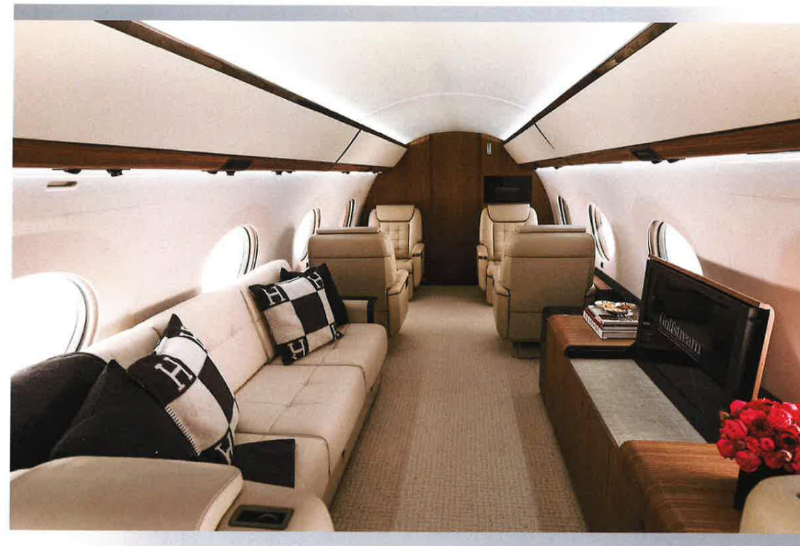
Mid Cabin – Forward