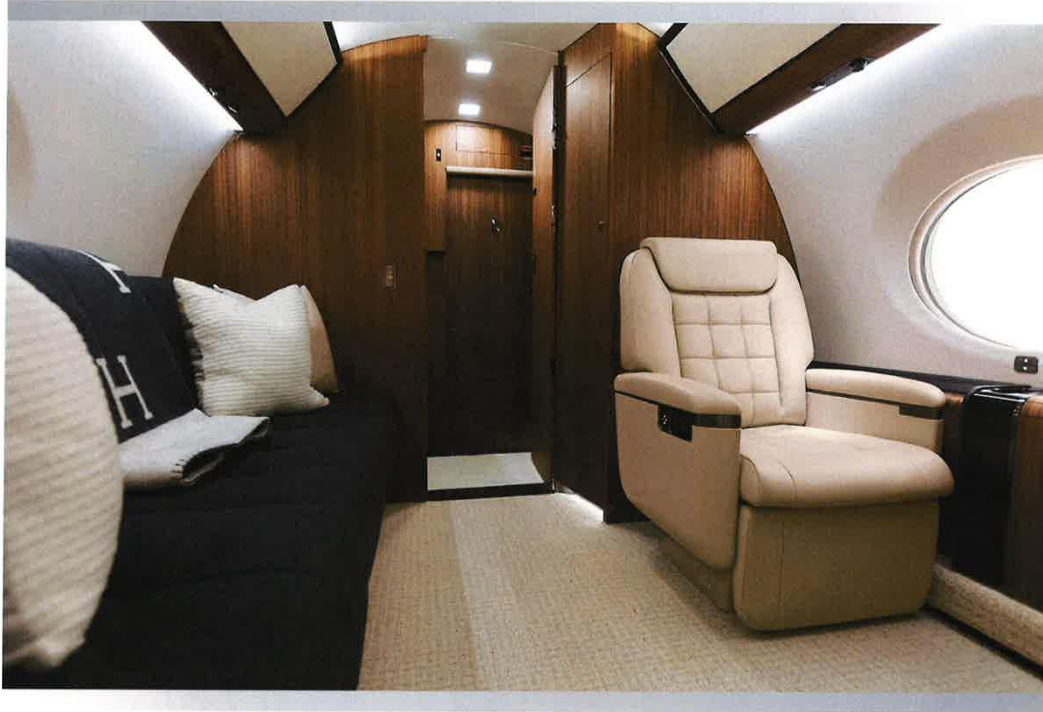
View of the aft divan and forward galley area, showing the leather seating and wood paneling.