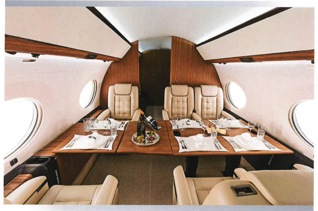
Mid Cabin - Aft