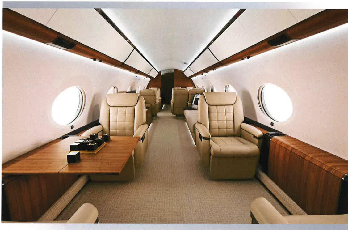
Forward Cabin – Looking Aft